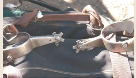
Spurs used in roughstock events must be dull. Shown are the bareback (top) and bull riding spurs.