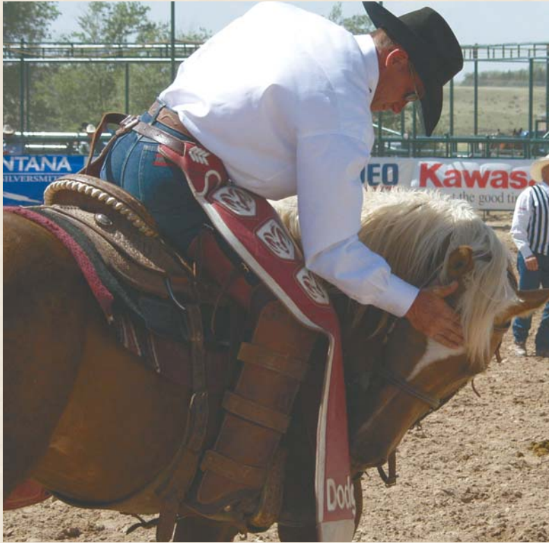
All rodeo livestock, including this pickup horse, are valuable to their owners and receive the highest standard of care.