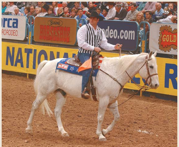
PRCA officials must be members of the association for five years and pass a written test before judging a PRCA-sanctioned rodeo.