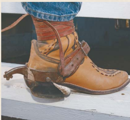
Only blunt spurs, like this one used in bareback riding, are allowed in PRCA competition.