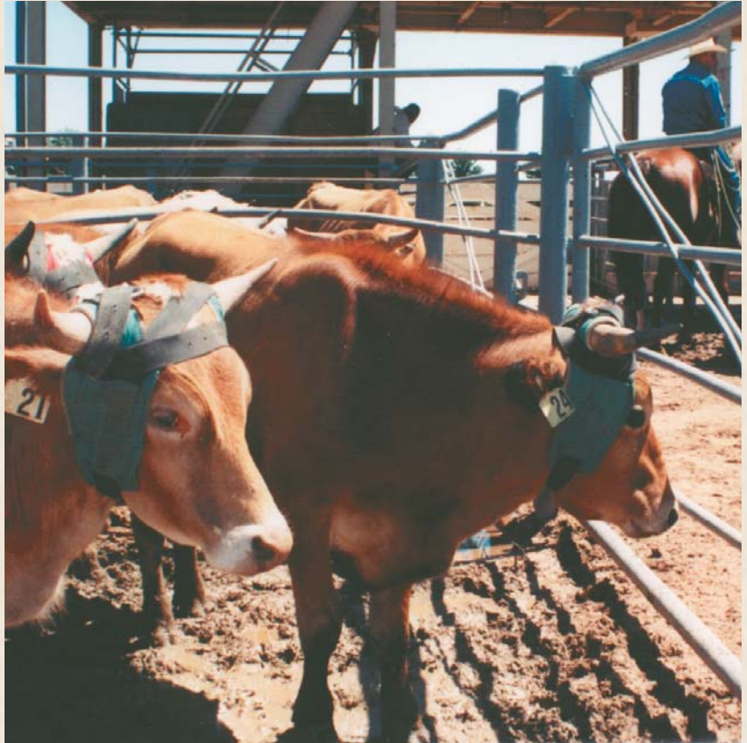
Horn wraps are among the safety equipment required for rodeo livestock.